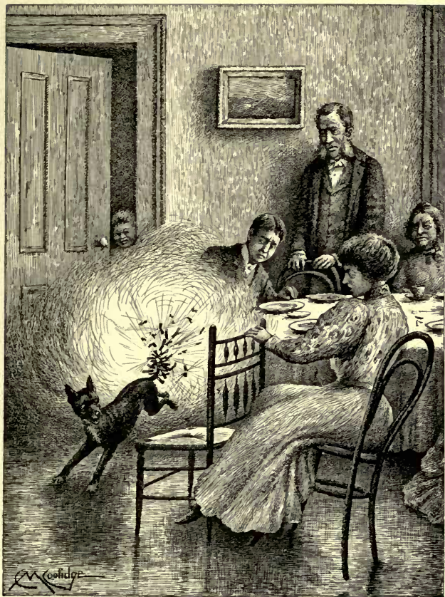
THE FUNNY FOURTH RACKET ON ENGLISH SOIL.