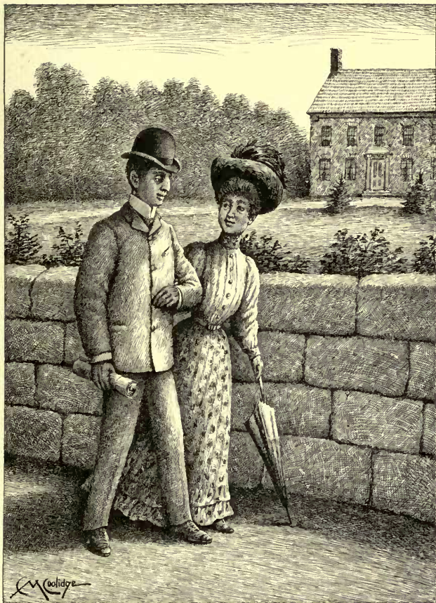
GOING TO VISIT THE PRESIDENT.