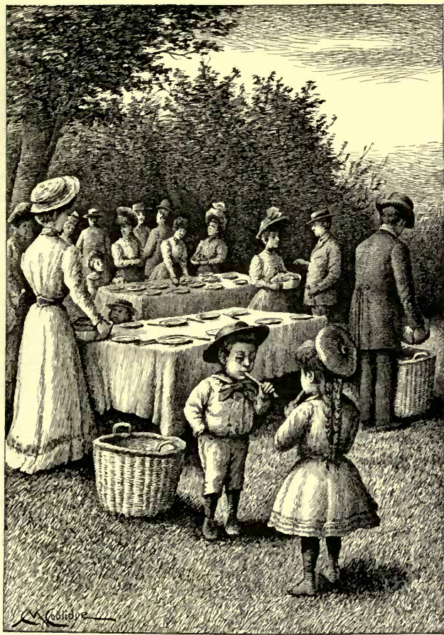
A FEAST IS BETTER THAN FIRECRACKERS.